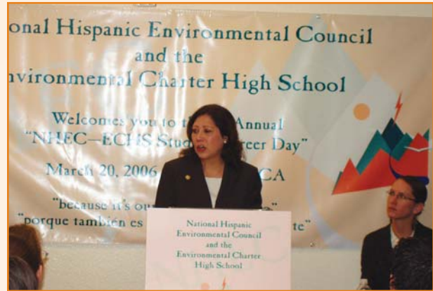
Congresswoman Hilda Solis (D-CA) addresses attendees. Cong. Solis's remarks on the need for people of color, and especially students, to be active in caring for our environment was inspiring.