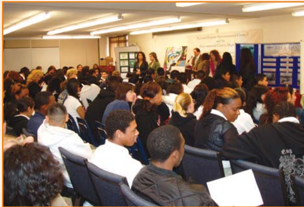
Over 200 students wait excitedly at the Opening Session for the start of the first-ever ECHS–NHEC Student Career Day!

America’s environmental challenges will require a new generation of leaders and professionals, and that generation will be minority. Through our High School Environmental Career Awareness Program, we seek to train and inspire this emerging generation in cities across the country. The following pages show the ECHS–NHEC Career Day. After viewing it, we hope you will support our efforts, and join us in our work.