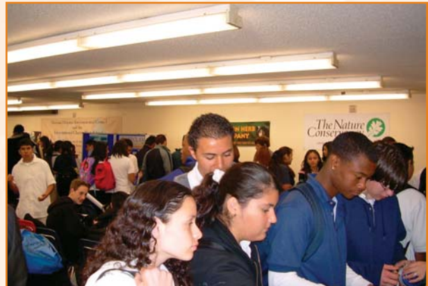
Students crowd the Exhibit Area to talk with the exhibitors and role models, and pick up materials on a range of environmental issues, organizations, and agencies such as the Nature Conservancy (shown).