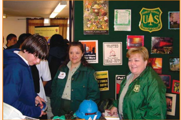
Some of the 20 exhibitors present were federal agencies, doing outreach to the community and talking with students about their missions and programs, as well as internships, scholarships, career information, and actual jobs. Here, the U.S. Forest Service does this, and talks about forests in CA.