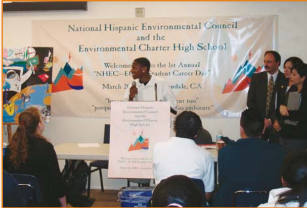
An ECHS student "ricked things off" with an environmental rap song he composed.